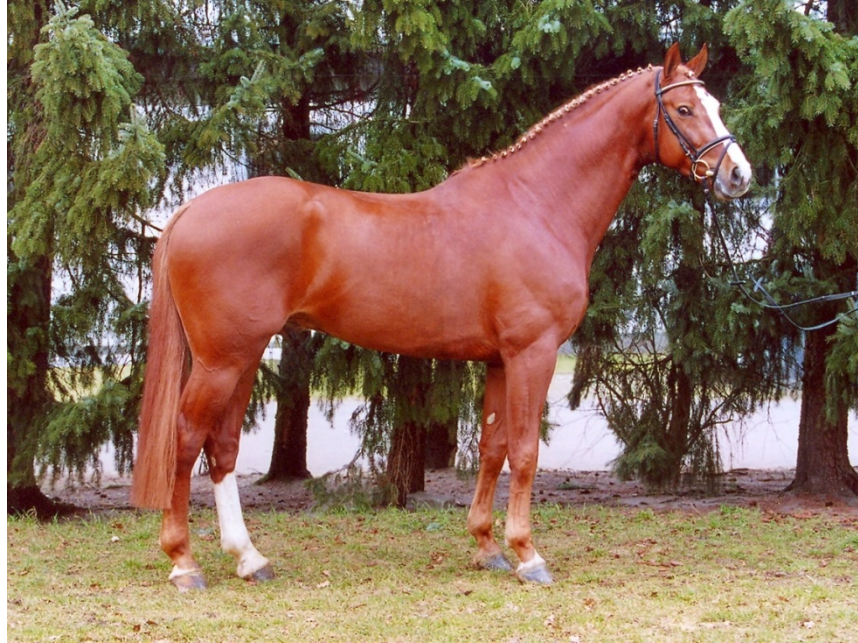
Image depicting the "open position" for inspection.

At the Classifiers' indication, each mare will be individually presented. First of all, your mare will be measured and have her identity checked against her registration certificate/passport. You will then be asked to stand her up for viewing of her conformation. Place the mare so that the Classifiers can see all four legs at once (i.e. the "Open Position", see image below).