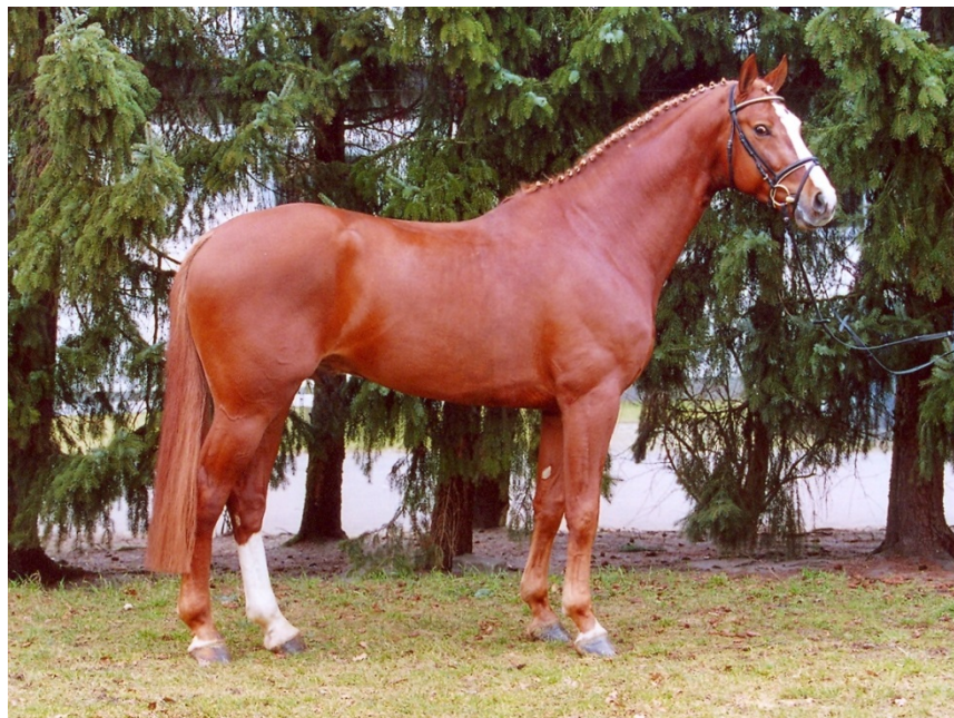
Image depicting the "open position" for inspection.

At the Classifiers' indication, each mare will be individually presented. First of all, your mare will be measured and have her identity checked against her registration certificate/passport. You will then be asked to stand her up for viewing of her conformation. Place the mare so that the Classifiers can see all four legs at once (i.e. the "Open Position", see image below).